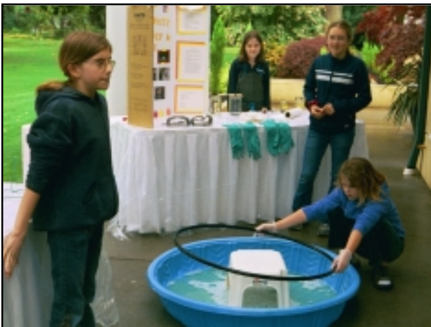
Bear Creek students' surface tension tester.